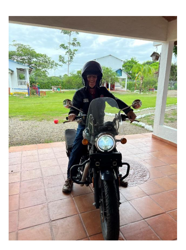
A motorbike is one of my primary forms of transportation as it is economical and efficient.