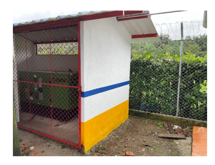
Progress at the Camp

Due to our mission Facebook page and webpage being taken over by thieves and mal intentioned individuals we were forced to start over with a new page on Facebook and a new webpage. While we lost most of the historic information we are moving forward and looking to the new beginning as we continue to serve Christ here in Colombia. This will be the first of our re-established monthly newsletters that we will publish initially on the internet and then hopefully offer a print version to those who prefer that media. Please like and follow us on Facebook and then check here for the monthly newsletter to keep updated in detail on what the Lord is doing in Colombia.