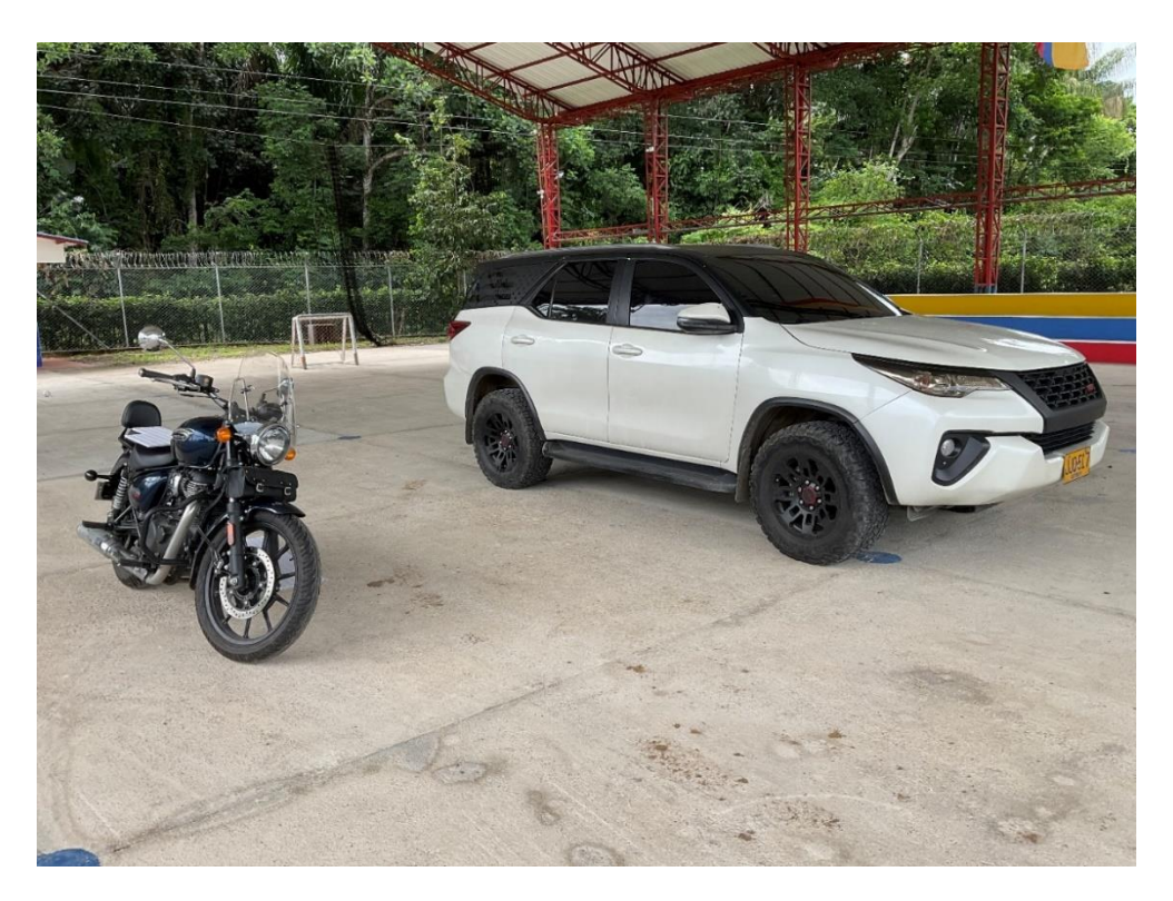
The 2019 Toyota Fortuner with only 56,000 on the odometer was purchased to replace our 32-year-old Mitsubishi.

Colombian Christian Mission Newsletter January to June 2024 Issue 1-6, Volume 51